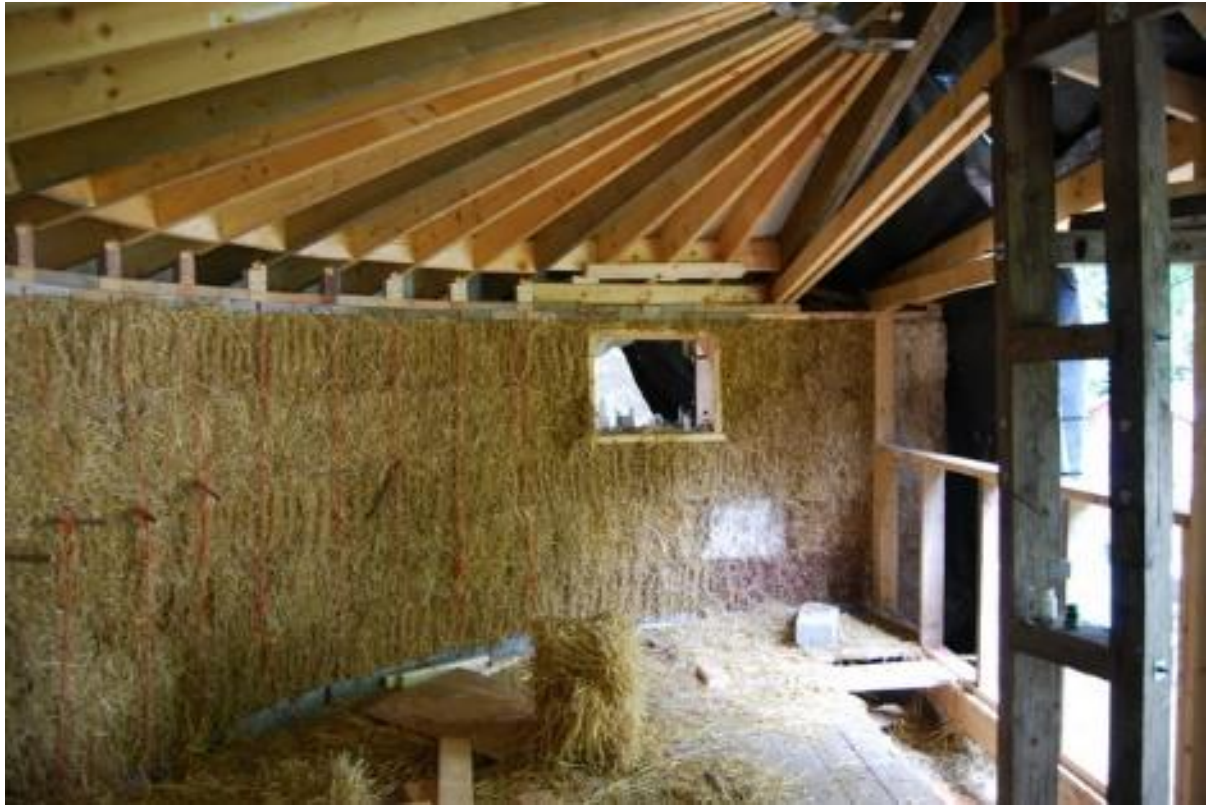
Image Credit: Straw Bale House, CAT Inside a partially built straw bale house, ©Hayley Green-CC BY-SA 2.0