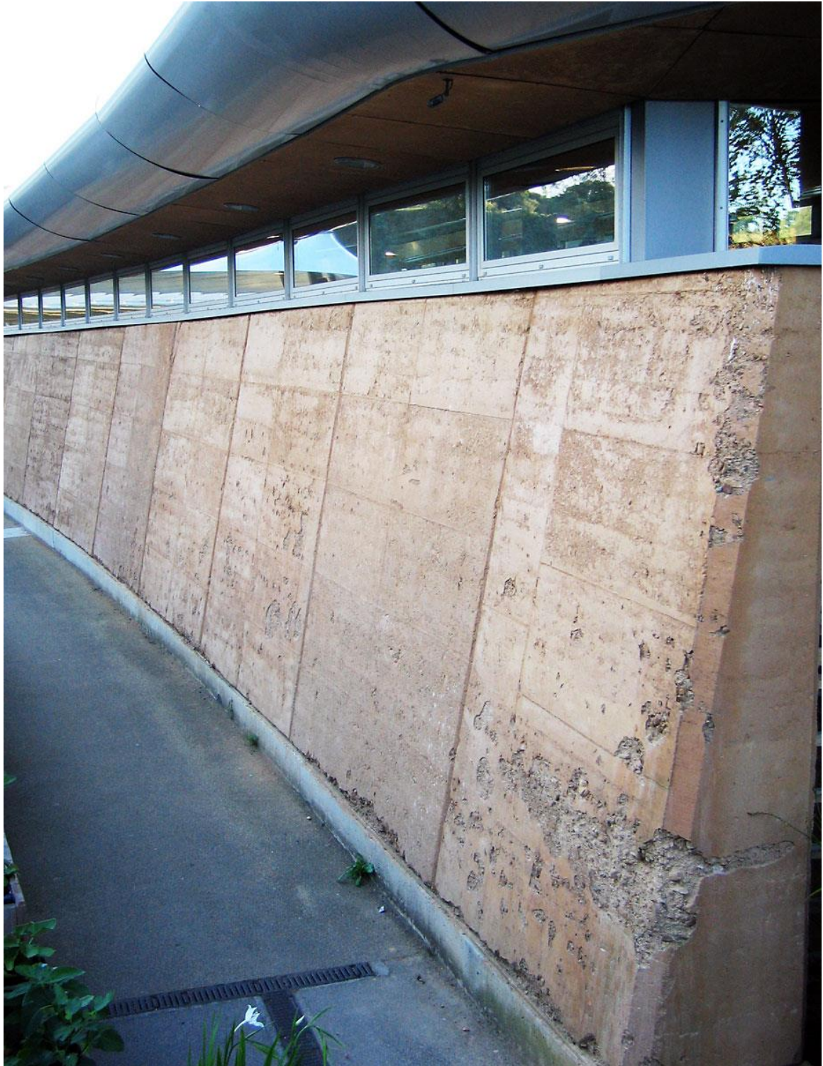
A rammed earth wall forming part of the entrance building to the Eden Project in Dorset, England.